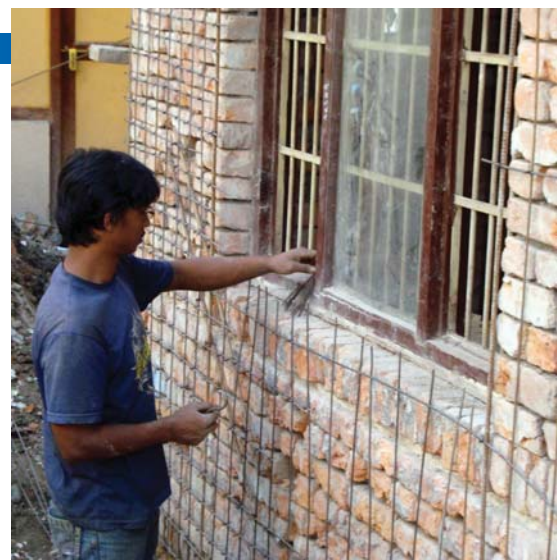
Wall jacketing for retrofitting