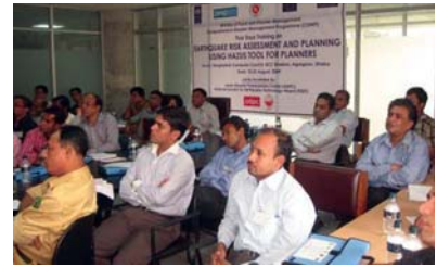
Participants of training, Bangladesh

earthquake risk reduction and contingency planning. There were around 26 participants at the training from Dhaka, Chittagong and Sylhet cities. The participants represented from different departments of Government line agencies, City Corporation & University.