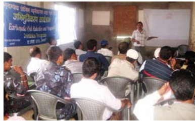
Orientation Program on DRR, Thankot, Kathmandu

orientations were provided for the DDC/VDC staff of Kathmandu DDC such as;