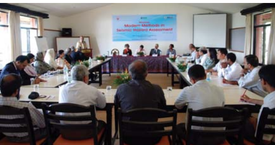
Glimpse of the Workshop

The Office of Foreign Disaster Assistance (OFDA) and U.S Geological Survey (USGS) in close coordination with National society for Earthquake Technology - Nepal (NSET) organized a week long workshop on "Modern Methods in Seismic Hazard Assessment" during