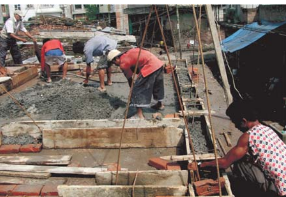
Construction of first floor at Buddha Jyoti Bal Udhyan LSS, Balaju, Kathmandu under SESP/DRRSP/Action Aid Nepal

under the financial support from World Bank/GFDRR since August 2008. Pilot project has been implemented at Nawalparasi and Lamjung District under which different level of training programs on school preparedness have been completed and survey of almost all of the public school buildings is in progress.