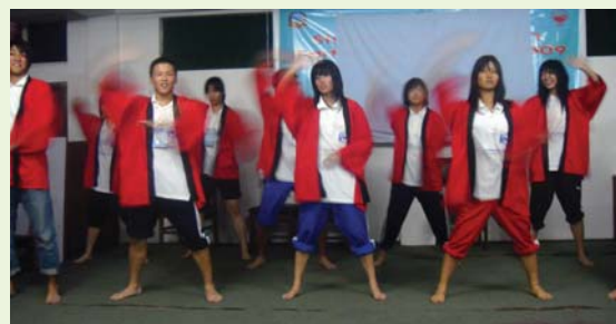
Japanese Students Performing Cultural Program

Representatives of the collaborating institutions referred to the high casualty of school-going children and teachers during recent earthquakes in the region, critically evaluated the programs in Nepal, highlighted the