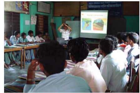
Participants of Mason training, Janakpur

Practice” Training for building capacities on Emergency response, organized by RedR India during 1-5 July 2009 at Dhulikhel Nepal.