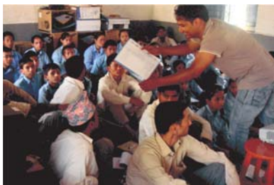
Teachers & students' orientation on earthquake safety in Nawalparasi under GFDRR/World Bank

Under NERMP with the support from USAID/OFDA, School Earthquake Safety Program (SESP) has been implemented in Mahendra Adarsha Higher Secondary School, Imadol, Lalitpur; Sakala Devi Lower Secondary School, Kadambas, Dibyapuri, Nawalparasi; and Kali Devi Higher Secondary School, Kavresthali, Kathmandu. NSET has implemented Disaster Risk Reduction through School Project (DRRSP) in four districts, Kathmandu, Makwanpur, Rasuwa and Banke with support from DFID through partnership with Action Aid Nepal. Also, NSET has been developing National Strategy for improving seismic safety of schools in Nepal