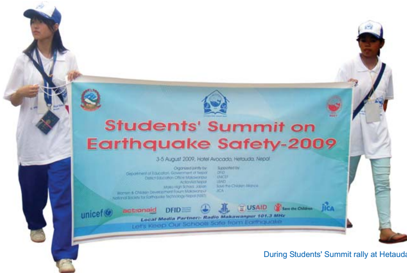
During Students' Summit rally at Hetauda

Amid series of interactive sessions of idea sharing, brainstorming & public advocacies, Students' Summit on Earthquake Safety 2009 has proclaimed Hetauda Resolution-2009 renewing their vigour and commitments to keep schools safe from earthquake. The residential 3-day Summit held during 3-5 August 2009 at Hetauda, Nepal drew a total of 125 participants including 66 students and 32 teachers from 30 public schools in 18 districts of Nepal, 10 participants from various disaster management committees, a delegation of 17 Japanese participants including 2 teachers and 10 students from Maiko High School of Kobe and 3 delegates from Support for International Disaster Education (SIDE) - a Japanese NGO created by previous students of Maiko High School and 2 delegates from Osaka University .