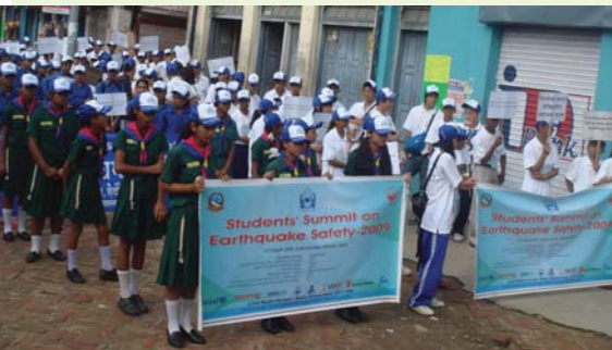
Rally for Earthquake Safety

students, the teachers, the activists committed to work further to ensure 1) all schools to be made earthquake safe, 2) to promote inter-school and international collaboration in school earthquake safety, and 3) proposed to expand the summit outreach to other seismic countries of the Asia.