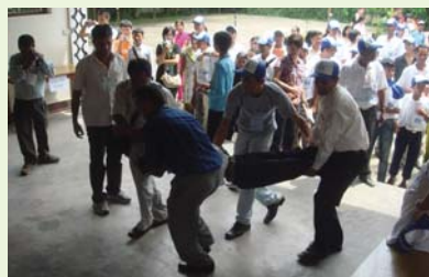
Drill Program exercised

students, the teachers, the activists committed to work further to ensure 1) all schools to be made earthquake safe, 2) to promote inter-school and international collaboration in school earthquake safety, and 3) proposed to expand the summit outreach to other seismic countries of the Asia.