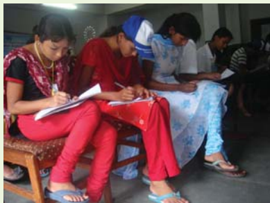
Participating students working in session

We, the participants of the Students' Summit For Earthquake Safety, 2009 , comprising 125 students and teachers from Nepal and Japan, together with our mentors from NSET, Maiko High School, SIDE, and Osaka University