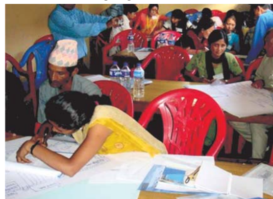
During Cross sharing workshop at Hetauda on 17th May 2009 under SESP/DRRSP/Action Aid Nepal