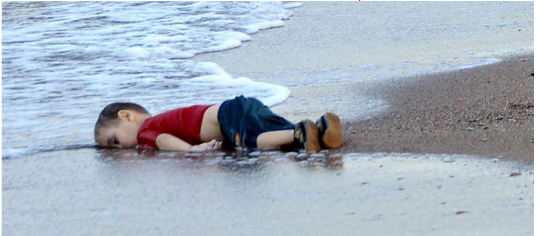
Alan Kurdi who died on the way to Europe in course of refuse – Sept. 2015

According to the World Disaster Report 2020 -- in the past ten years, 83% of all disasters triggered by natural hazards were caused by extreme weather and climate-related events, such as floods, storms and heat waves. The COVID-19 pandemic has shown how vulnerable the world is to a global disaster. Humanity and international cooperation are still lagging behind. Hence, communities and countries still need to adapt to its realities.