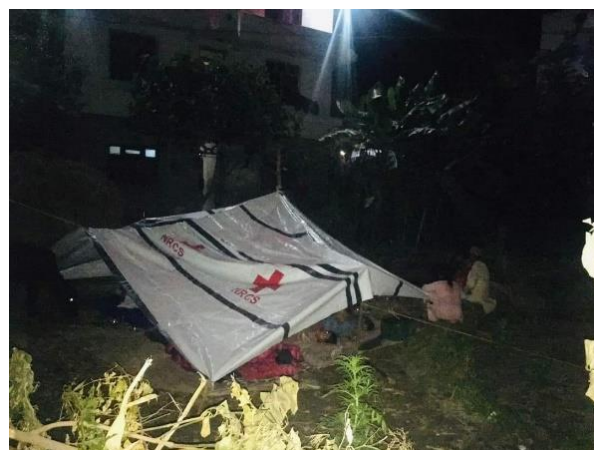
Earthquake affected people are staying under tarpaulin