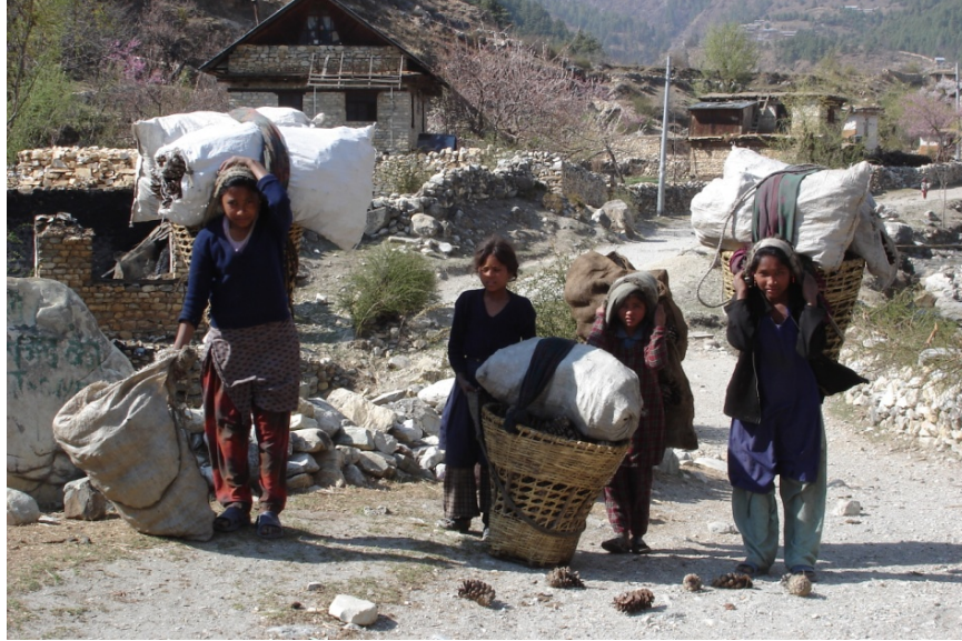
The drudgery of Humla girls. Photo by Karen Barkley, Humla, 2008.

Men, as breadwinners, also bear a lot of pressure, especially when their traditional livelihoods do not ensure food security and they are unable to provide for their families' needs. In Nepal, more and more men are leaving their villages, looking for any kind of employment in the cities or abroad. The poorest men have to accept low-paying jobs and live in terrible conditions. Besides the immediate economic hardship, they also face a lot of mental and emotional stress.