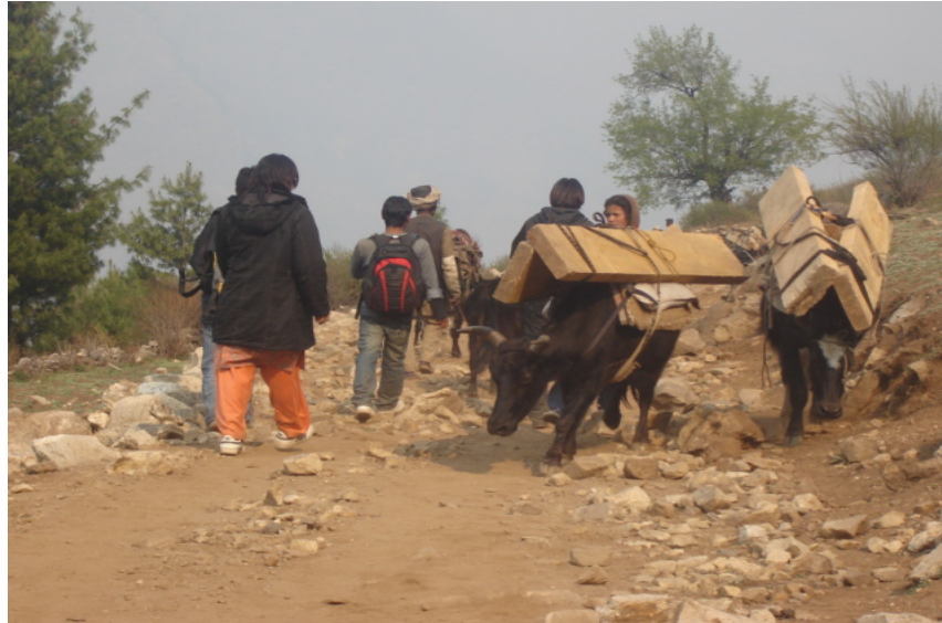
Men trading timber in Humla.

In Humla, food scarcity is not a new phenomenon, and people have adopted different strategies to cope with it. Trading forest resources is one option, sometimes the only one, even though it contributes to the cyclical depletion of their resources. The other option is migration, and in rural Nepal, it is generally men who migrate to find jobs. For some, it is an enormous challenge to adapt to a new environment and lifestyle. For women, the result of men's migration is usually an increased workload and all the added stress that this creates. Box 1 demonstrates that coping strategies are gender-specific, and subsequent policy options should also be gender-sensitive.